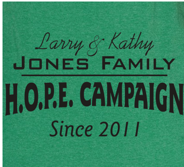
Front of Shirt (sm. on left chest)