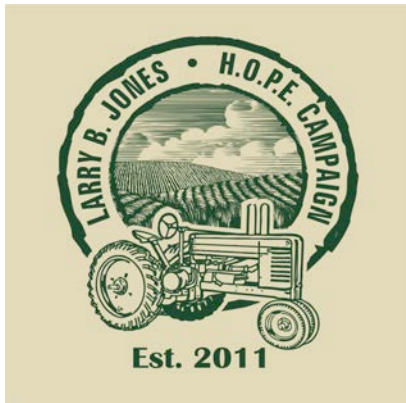
Front of Shirt (sm. on left chest)